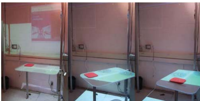
Figure 1. Information Table

The decrease in price of multimedia projectors has made it possible to treat an entire space as a single, high-resolution display. With information projected throughout the space of the kitchen, users no longer have to carry around books or computers to inform their tasks. We dispersed projectors and other types of illumination throughout a kitchen to uncover the range of interactions between the kitchen and its users. Various input devices coupled with the projectors inform the projected content. Gesture sensing and interaction-free displays provide information where and when it is needed while requiring minimal interference (Hillerer, Feiner, & Pavlik, 1999).