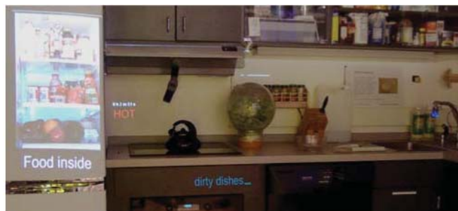
Figure 2. Information Annotation of Kitchen

In addition to following physical movements, Information Table changes projected content based on what task is being performed. When the movable table is placed against a wall, it acts as a countertop for single-user frontal work. For such work, projected information is best placed in front of the user on the wall where it will not interfere with hands or the work surface. The image shifts from the ceiling-mounted projector to a wall-mounted projector when the table approaches the wall of the kitchen. When the table is moved to the center of the room, it acts as a dining table. The projection shifts to the ceiling-mounted projector, and a concentric game or menu is displayed on the table.