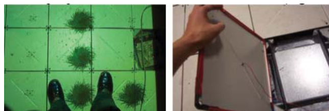
Figure 5. Sociable Floor

We use a modular tile floor with capacitive sensors under the 12-inch x 12-inch raised modules. Ceiling-mounted projectors paint the floor with information gathered from where and when people stand on the various tiles (Fig. 5).