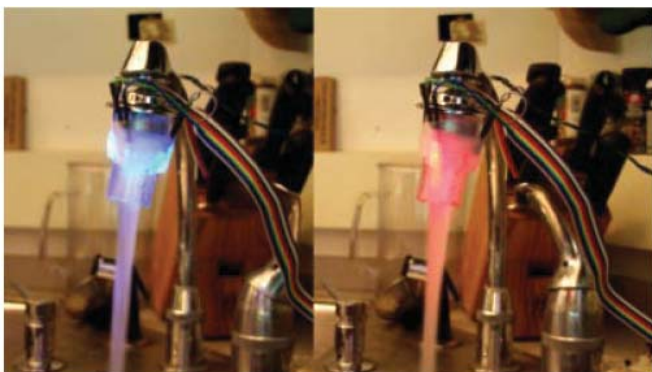
Figure 3. HeatSink

ances, where users will be certain to notice it. The same system used to annotate the kitchen can be used to decorate the space. Games and other interaction can be projected on work surfaces when the work is finished, while decorative textures can be mapped to change the mood and function of the space depending on its function.